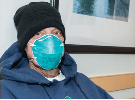
"N95 mask for patients"