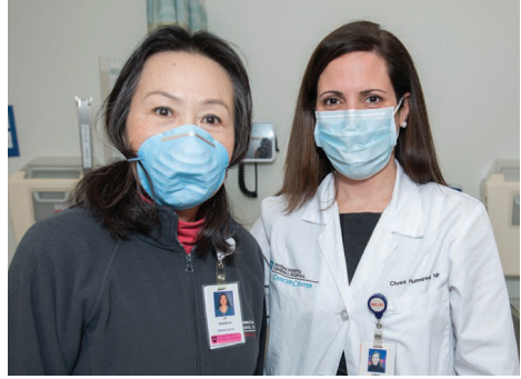
Masks for caregivers and visitors